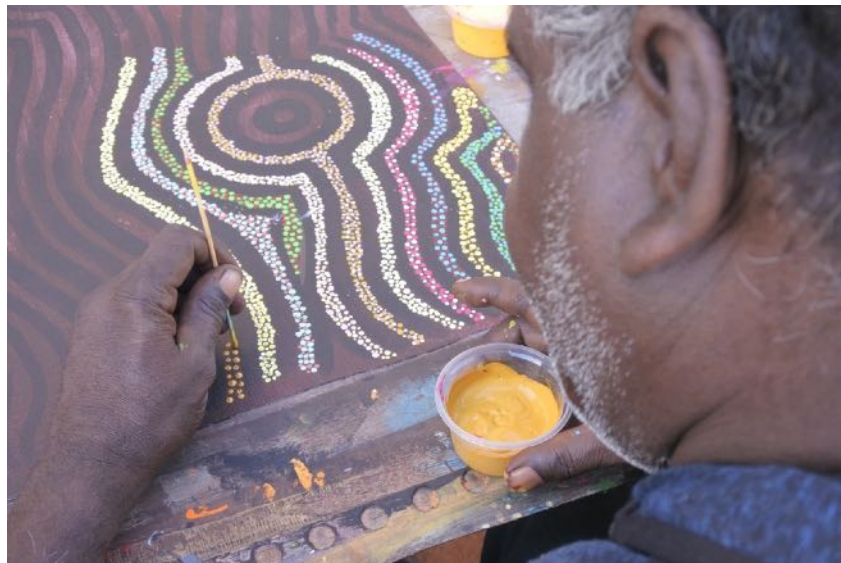
Figure 2: An Aboriginal artist at work

Many of the stories passed down from generation to generation involve supernatural beings. This is especially the case in the stories dealing with the creation of the world. They are used to explain the origins of people, plants, animals and even landform features. Supreme beings, in one form or another, appear in ancient myths about creation in most cultures.